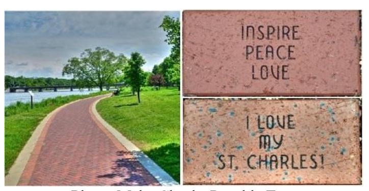
Please Make Checks Payable To: River Corridor Foundation of Saint Charles Mail To: P.O. Box 3753 Saint Charles, IL 60174

To order online please visit: www.polarengraving.com/RiverCorridorFoundationofSaintCharles